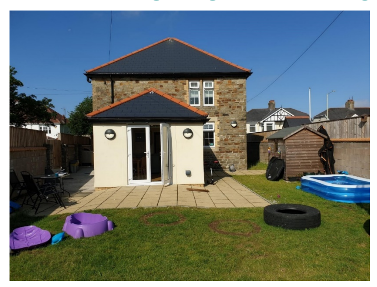
STATEMENT OF PURPOSE